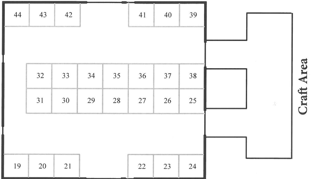
EXHIBIT BUILDING #2